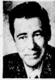
Inserted by Couvelier for Saanich committee